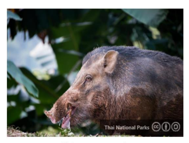
Wild boar - Kaeng Krachan