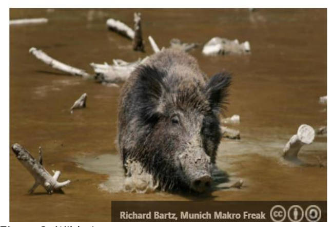
Figure 3. Wild pigs

Vietnam Experiences in taking Care of Wild Pigs