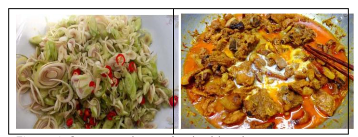
Figure 4. Steps to make stir-fried wild pork meat

Below figure shows us steps to make delicious wild pork: