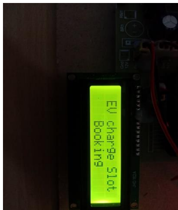
Figure.2: LCD Display the EV Charging Slot

arrives at the slot he needs to enter the code to authenticate and verify and he needs to enter the amount of charging he needs and pay the amount, as soon as payment is done, EV starts charging when it charges up to the paid amount if automatically turns off. Throughout the process, all details will be displayed in the LCD display.