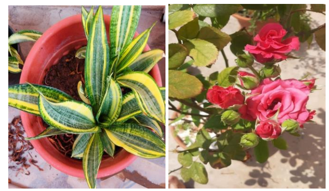
Figure 3.6. Croton and Rose plants at day 20 (with SAP)

Figure 3.3 and 3.4 shows the growth comparision of plants when the SAP is mixed. Overall in the study period, the plants showed an upraising growth for all planting conditions. The SAP mixed plants have grown faster than without the SAP mixed plants. The SAP mixed plants have shown healthier growth and weight than the other plants. Table 3.2 shows the detailed comparision of our SAP's with Kiara and general SAP and confirms that the above prepared SAP is a very good fertilizer and water absorber.