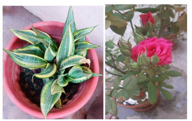
Figure 3.5. Croton and Rose plants at day 20 (without SAP).