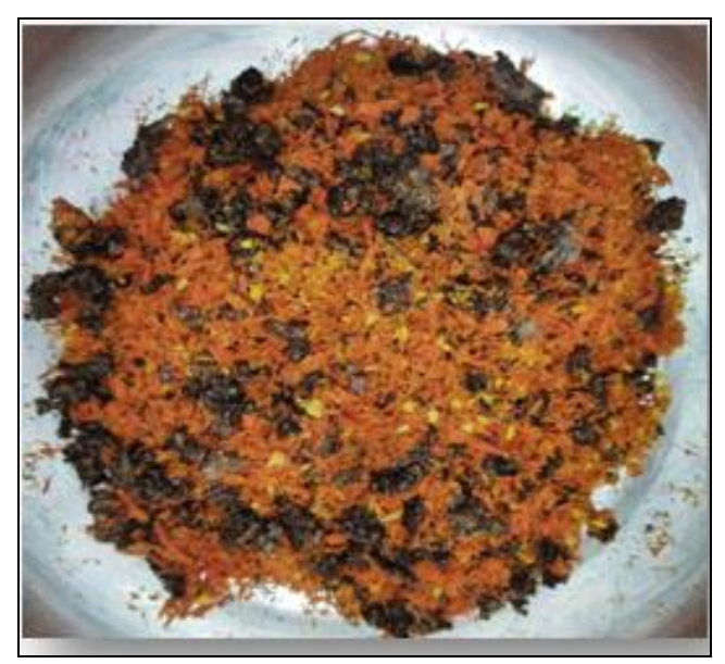
Figure 3.1. SAP at DAY 1

The super absorbent polymers have been prepared in simpler manner as shown in figure 3.1 and 3.2 at day 1 and day 20 respectively. SAP containing carrot and potato peel tested for water retention ability. The result indicates that the SAP holds high water absorbing ability.