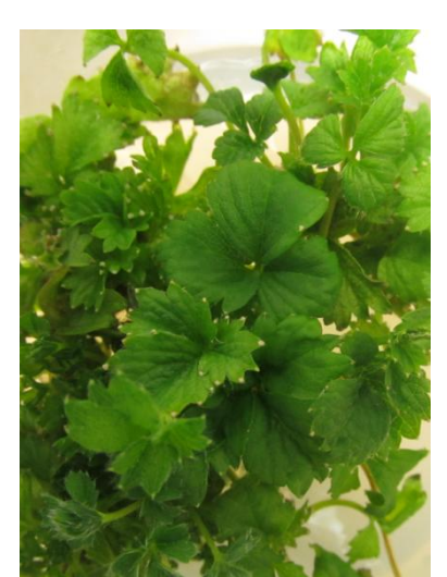
Figure 1. General view from plants in medium 5which is determined as the best medium for shoot development